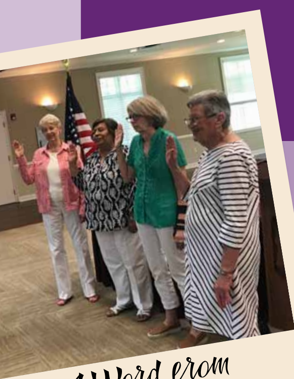
A Word from the President